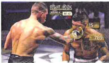
Crunching Numbers: BKB fights will show data from in-glove sensors

DirectTV is taking on the boxing establishment, launching a fight series the El Segundo satellite provider hopes will revolutionize the sport by drawing a much larger audience and greater pay-per-view profits.