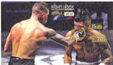
Crunching Numbers: BKB fights will show data from in-glove sensors

DirectTV boxing dons high-tech gloves, ditches ring By SANDRO MONETTI Saturday, April 4, 2015