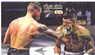
Crunching Numbers: BKB fights will show data from in-glove sensors

DirectTV boxing dons high-tech gloves, ditches ring By SANDRO MONETTI Saturday, April 4, 2015